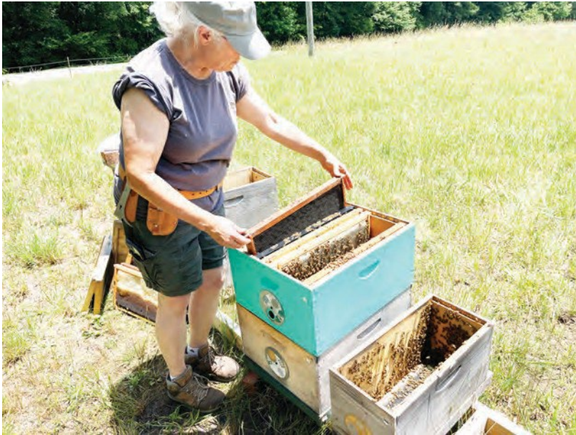
Locally produced in Chatham County NC