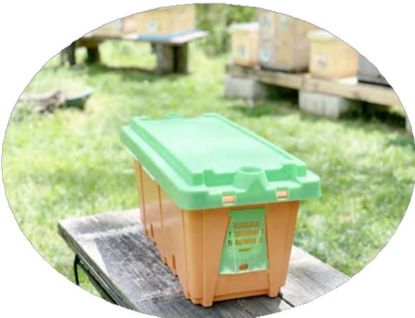
5 frame nucleus colony in secure Pro Nuc carrier