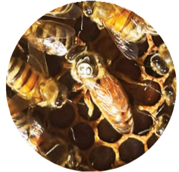
Young, healthy, proven queens